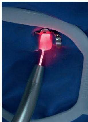
Fig. 02 - Photodynamic therapy.

Finally, the cone test was performed ( Figure 3 ) and the root canal was sealed with BioRoot™ RCS