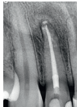
Fig. 05 - Seven-month post-operative radiographic image showing complete periapical healing.