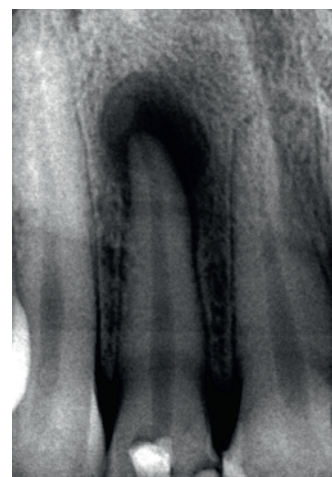
Fig. 01 - Initial X-ray.

Laser DUO low-power laser device (MMO, São Carlos, SP, Brazil) with a 0.005% methylene blue photosensitizer (Botica Ouro Preto, Maringá, PR, Brazil). The PDT protocol was performed by inserting methylene blue 0.005% inside the canal, waiting for three minutes (pre-irradiation period) with agitation for one minute with an ultrasonic insert (Irrisonic – E1, Helse Ultrasonic, Santa Rosa de Viterbo, SP, Brazil).